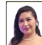
Soci Ame Patagani-Viking Community Service